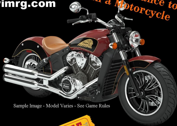
Sample Image - Model Varies - See Game Rules